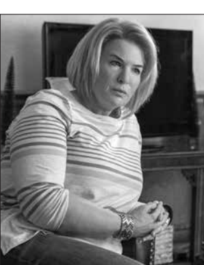
Renee Zellweger 8 p.m. on NBC/WSTM NBC/WHEC American Auto