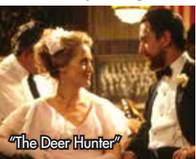
"The Deer Hunter"