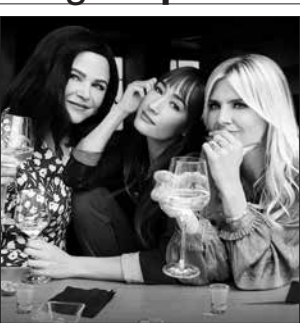
Ginnifer Goodwin, Maggie Q and Eliza Coupe (left)

8 p.m. on FOX/WUHF FOX/WSYT Joe Millionaire: For Richer or Poorer