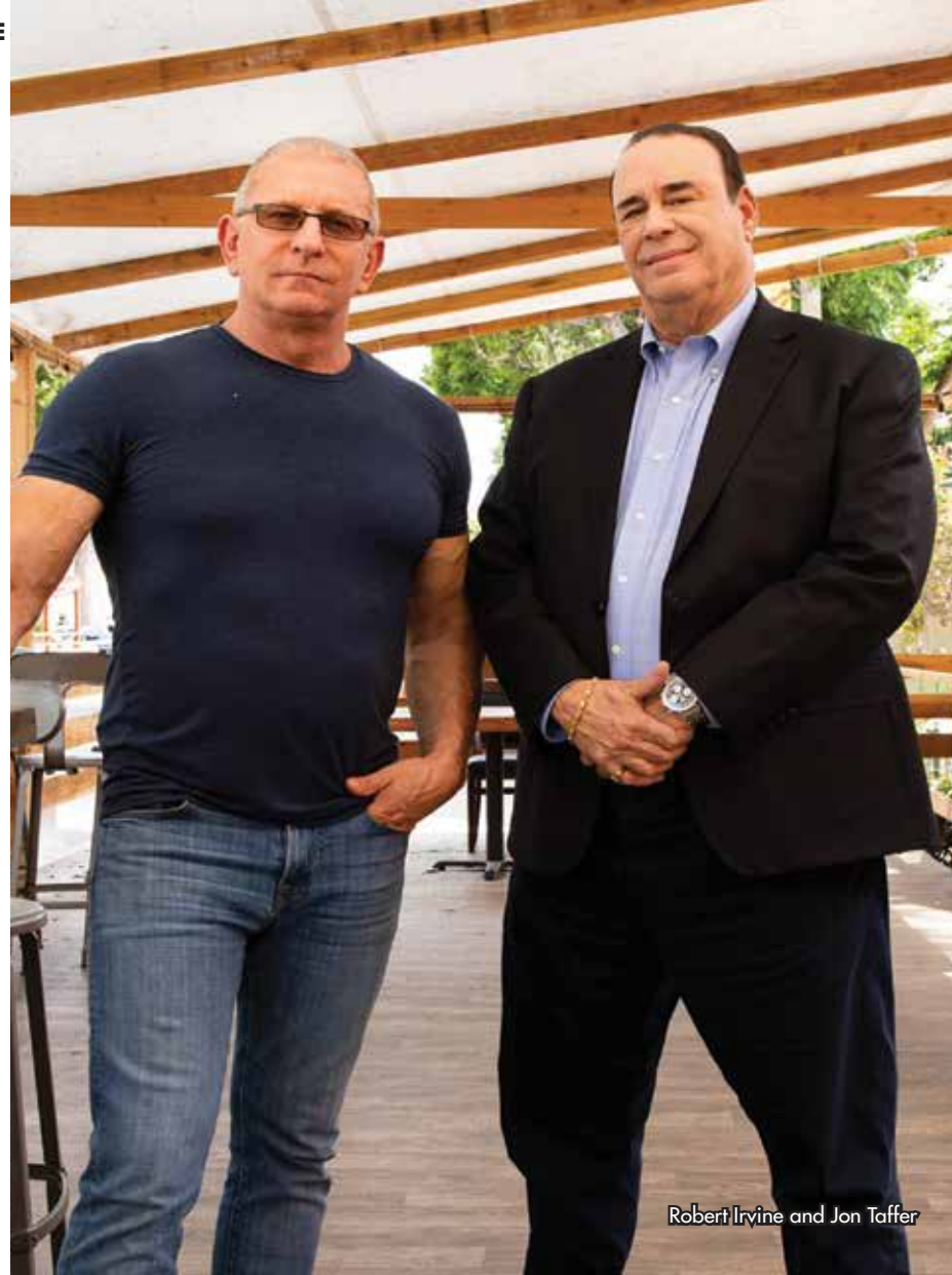
Robert Irvine and Jon Taffer

"So interestingly, I think the competitive nature of the show added to the motivation level of the owners and sort of made them more successful in their execution."