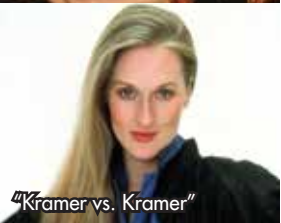
"Kramer vs. Kramer"